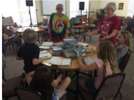
Studying the Bible Stories