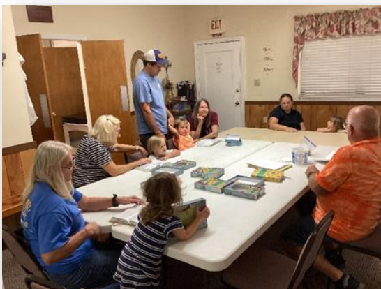
Learning about Sadrach, Meshach and Abednego

We are looking forward to seeing you on Wednesdays. Come learn and enjoy all the things that God has blessed us with. God Bless!! The Kid's Klub Team