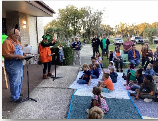
Storytime at the Pumpkin Patch on Wednesday night