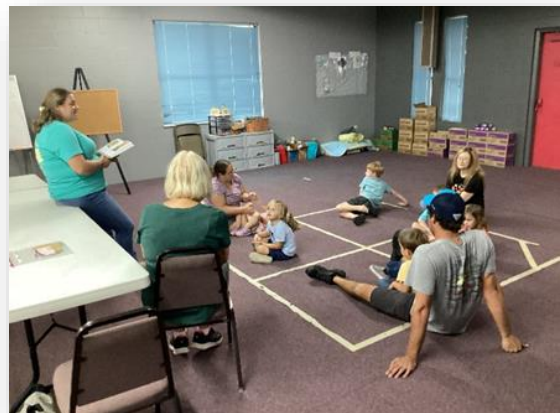
Learning about Daniel in the Lion's Den