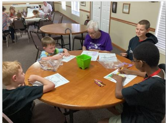
Sharing our love by coloring shields for the Kairos Outside Retreat.